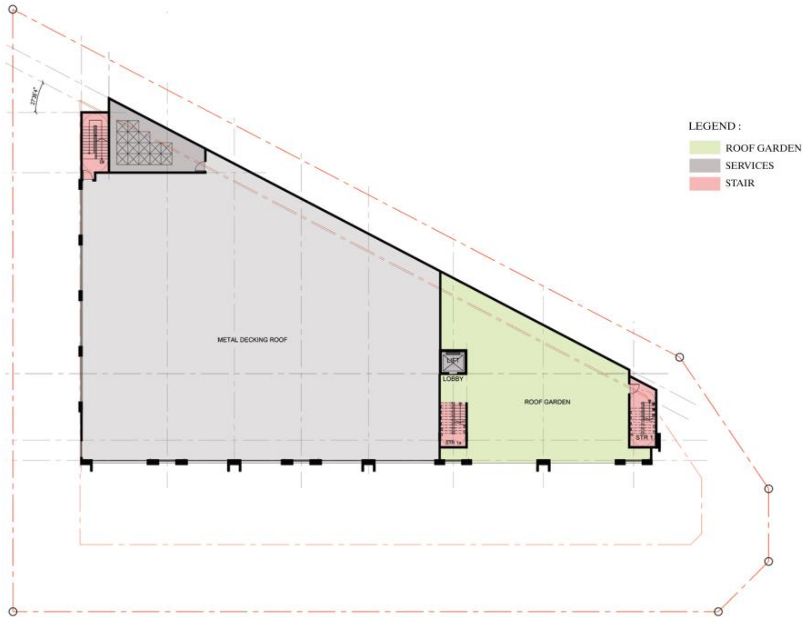
ROOFTOP FLOOR PLAN